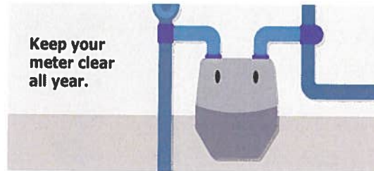
Gas Meter Safety

It's important to keep your natural gas meter and exhaust vents free of ice and snow in winter, and clear of storage boxes, garden tools and vegetation in summer. This helps ensure that gas-fired equipment functions safely and efficiently and allows Union Gas easy access for accurate meter readings or emergency response.