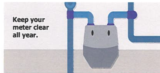
Gas Meter Safety

It's important to keep your natural gas meter and exhaust vents free of ice and snow in winter, and clear of storage boxes, garden tools and vegetation in summer. This helps ensure that gas-fired equipment functions safely and efficiently and allows Union Gas easy access for accurate meter readings or emergency response.