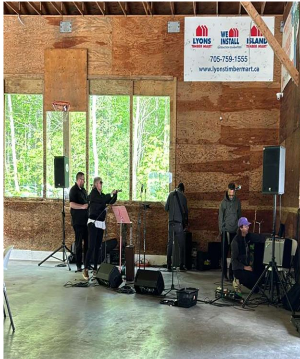
Pictured above: band Book Club from the June concert

For more information and updates, check our Facebook Page Facebook.com/princereccommittee