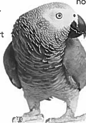
Jimmy Sarnia, ON

If an emergency occurs when you are not at home, you can still be prepared. Set up a buddy system with your neighbour. Make arrangements that in the event of an emergency and you are not home they will take care of your pet.