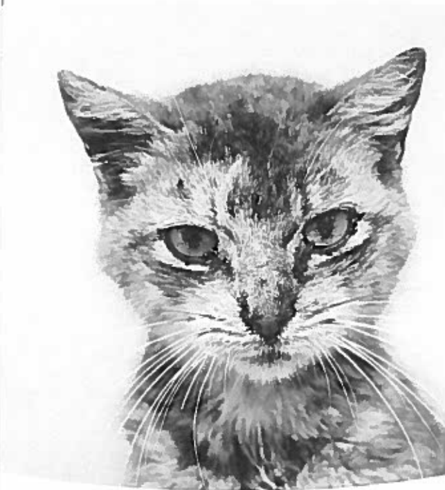
Buster Collingwood, ON